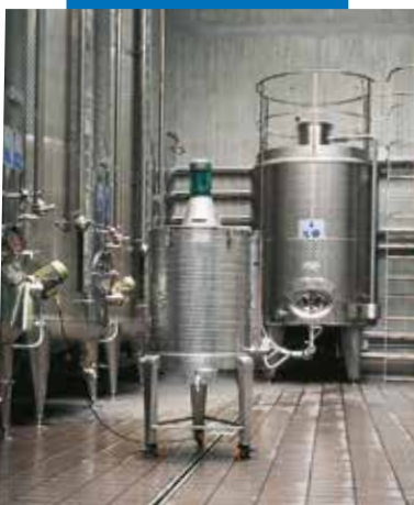
An example of a grouted wine cellar floor