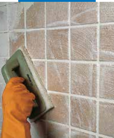
Finishing of single fired tile wall with a Scotch-Brite® pad