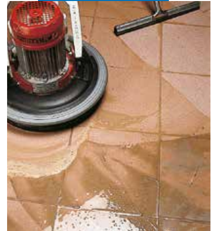
Finishing a porcelain tiled floor with single-brushed power float or rubber squeegee