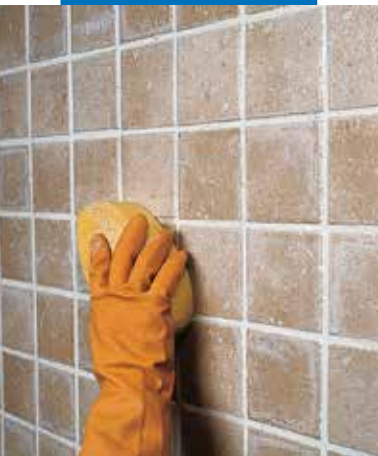
Finishing of single fired tile wall with a sponge