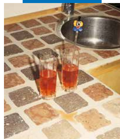
An example of a bonded and grouted kitchen worktop