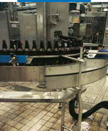
An example of a grouted brewery floor