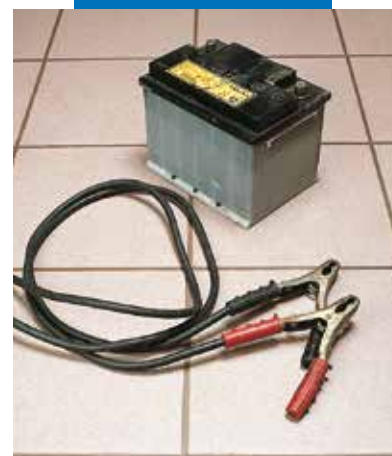
An example of a grouted battery room

Kerapoxy is supplied, with mixing proportions carefully measured, in drums containing component A and bottles of component B to be mixed when using the product. The total weight of the units is: 10, 5 and 2 kg in total.