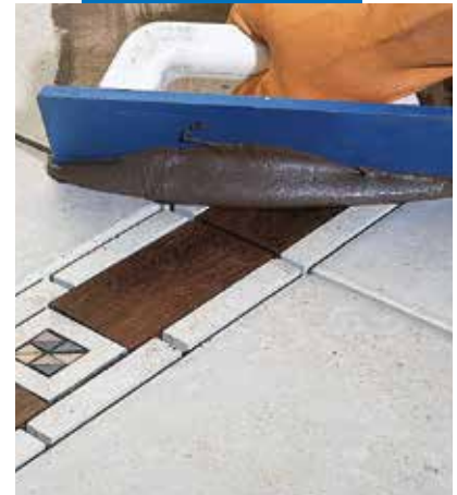
Grouting a ceramic tile floor with wood inlays with a trowel