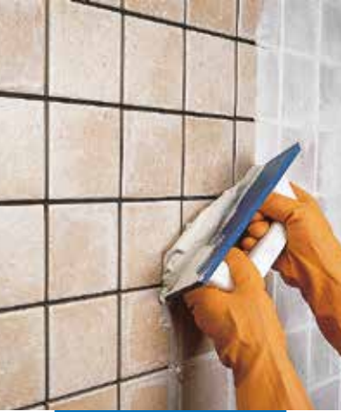
Grouting of single fired tile wall with a float