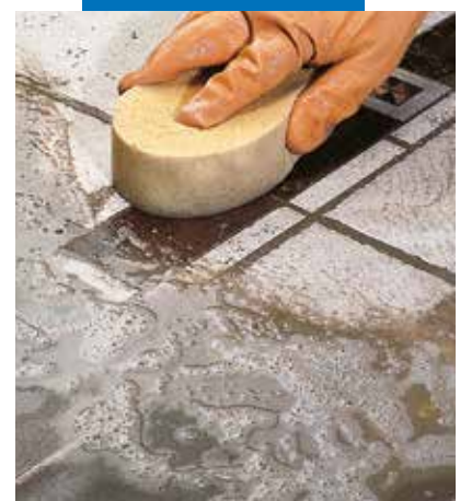
Finishing a ceramic tile floor with wood inlays with a sponge