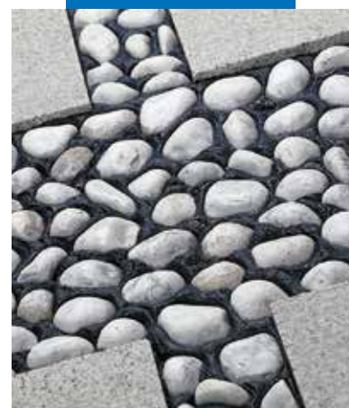
An example of grouted ornamental stones